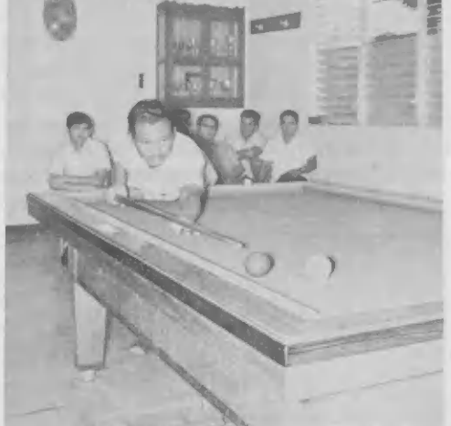
Billiard game finals